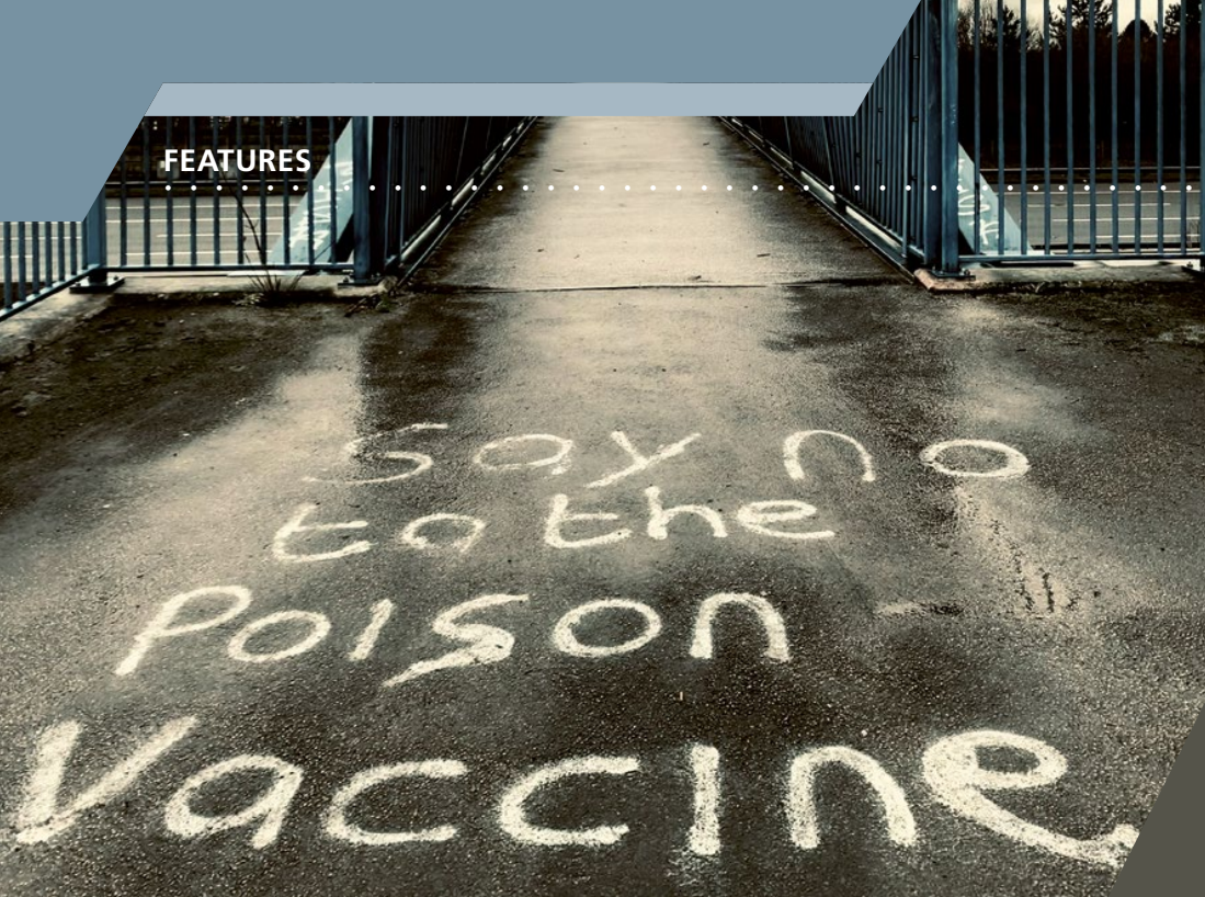
Graffiti on a Manchester motorway bridge about COVID-19 being a hoax

Charles Darwin and members of the Spice Girls). The warning and weakened dose are meant to trigger people's vigilance and attention (to start the production of mental antibodies), and the message offers people concrete ways to resist the misinformation. After people were inoculated, participants were exposed to a full dose of the misinformation. Our findings showed that while those who received a placebo treatment were negatively impacted by the misinformation, inoculated participants were substantially less likely to be fooled by it. This experiment was replicated three times and extended to show that even one week after the intervention, inoculated individuals were still protected against the misinformation attack.